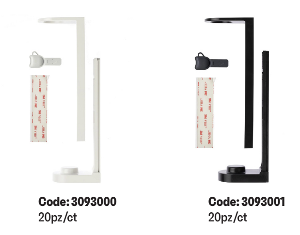
Pump dispenser bracket